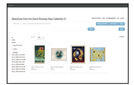
LUNA Library Thumbnail View